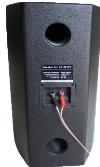
Connections at Rear